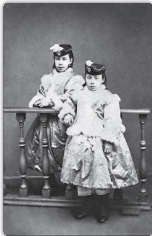
❖❖ Girl in house dress. Photograph by S. Novodereshkin. Zadonsk. 1869.