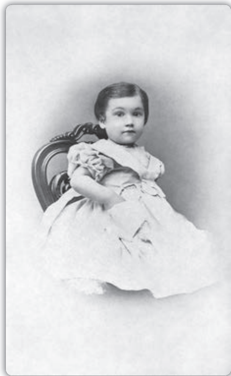
❖❖ Girl in formal dress. Novaya fotografiya Rossiskogo obschestva liubitelej sadovodstva . Moscow. 1865.