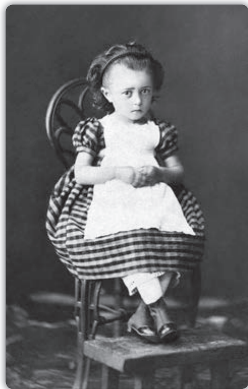
Girl in inexpensive dress and 'Garibaldi' outdoor jacket. Russia. 1867.